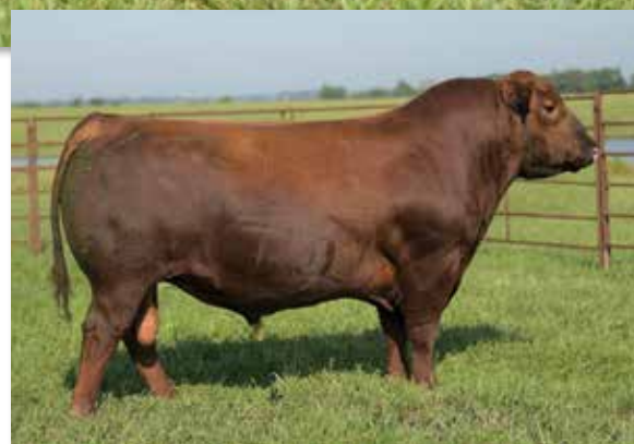
LACY FOUNDATION 448 - SIRE OF LOTS 1 - 3