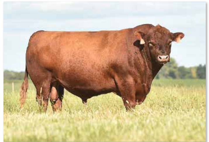
LACY GOLD BAR 1120 - SIRE OF LOT 73 & 74