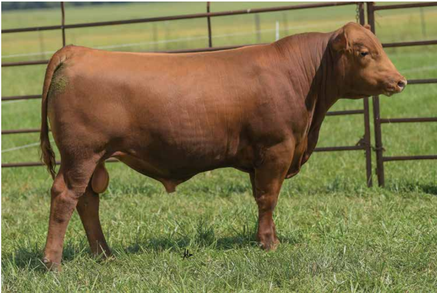
LOT 22 - LACY FOUNDATION 147F