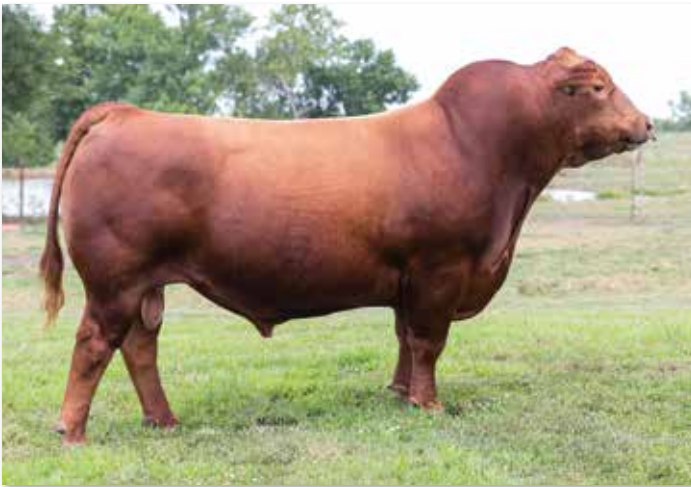
LACY LEGACY 6097 417 - SIRE OF LOTS 61 & 62