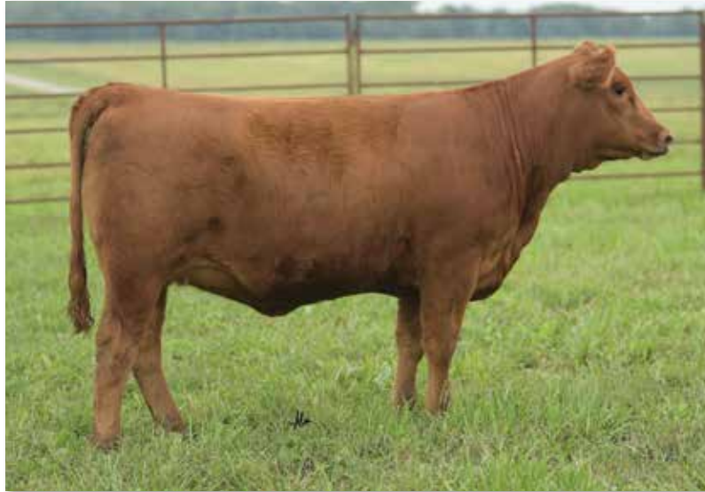
LOT 74 - LACY ANISE 62B 046F