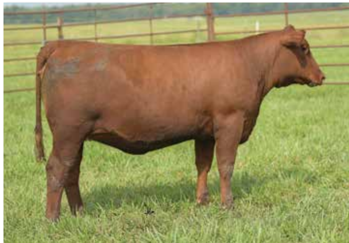
LOT 51 - LACY LAKOTA 326 071F

071F is another descendant of the Lacy Marie 8190 cow family that calls home to Drexel, Missouri. Her dam, Lacy Lakota 0251 326, pictured below is a stunning young female that offers a look of quality and balance from the profile, with a shot of added power and stoutness that is sure to be admired. She ranks top 18% HerdBuilder, top 25% GridMaster, top 8% WW, top 6% YW, top 6% ADG, top 12% HPG, top 9% CW, and top 13% REA. A herd bull producer that will add performance and carcass merit to her progeny.