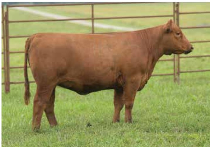
LOT 65 - LACY LAKOTA 7099 109F