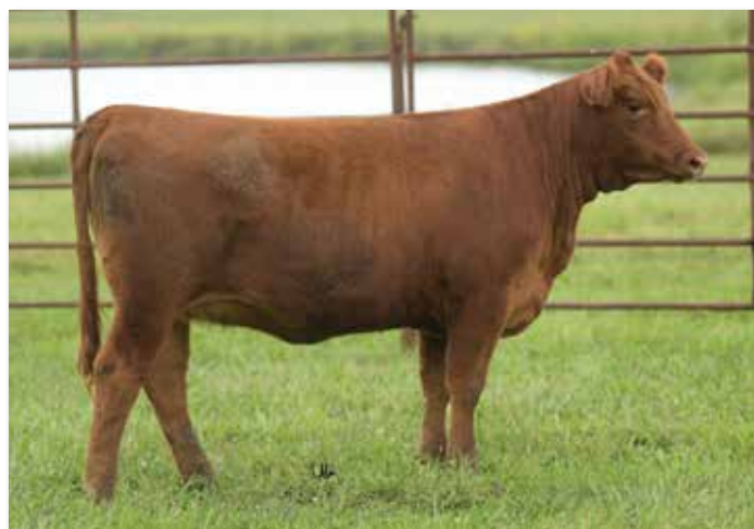
LOT 53 - LACY LANA 493 077F

Lacy Lana 493 077F is another Cornerstone 069C female that is the right type and kind to be a productive female in production. Her dam is the Lacy Gold Bar 1120 daughter, Lana 991 493. She charts among the top 16% of the breed for Milk and top 29% Marb.