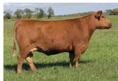
LACY LAKOTA 7097 482 - SISTER TO LOT 10