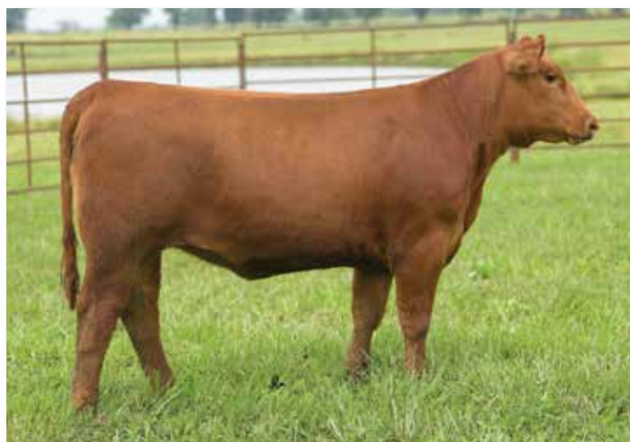
LOT 67 - LACY MATTIE 1122 153F

Lacy Lakota 8105 110F is royally bred! Here is a maternal sister to the Lot 1 featured strong aged bull, the lot 5 Collusion stud, lot 6, and the lot 14 Freight Train herd bull prospect. There are countless individuals of power that can be identified from the influential Lakota 8105 matron as her impact can certainly be seen. Massive, bold, three-dimensional, and broody are the best ways to describe this future herd matron. She charts top 17% HerdBuilder, top 29% CED, top 33% ADG, top 18% Milk, top 24% HPG, top 23% Stay, top 18% YG, and top 12% REA. Balanced and proven genetics!