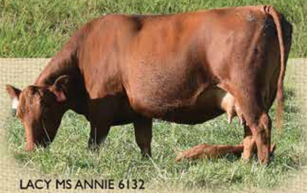
LACY MS ANNIE 6132 DAM OF FOUNDATION

ORDER SEMEN ONLINE TODAY! PUREBEEFGENETICS.COM