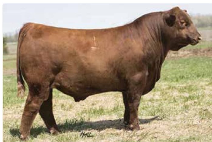
PIE CINCH 4126 - SIRE OF LOTS 56 - 58

Annie 0233 070F is one of three broody daughters of PIE Cinch 4126, one of the most popular sons of the great LSF Saga 1040Y stud. The dam of this powerful, big middled female is the Legacy 6097 sired daughter of Lacy Ruby 7099. She ranks top 18% GridMaster, top 24% WW, top 7% CEM, top 24% Stay, and top 18% CW.