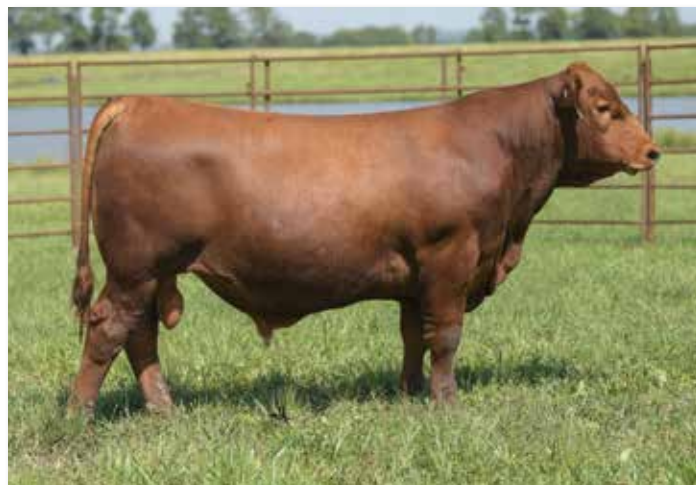
LOT 40 - LACY NEXUS 128F

Lacy Gold Bar 1120 has been a consistent and steady producer at Lacy's Red Angus as one of the foundation herd sires, and a son of the great Gold Bar 0251. The dam of this stud is sired by 5L Summit 1145-6327. He ranks top 10% Milk and top 8% HPG.