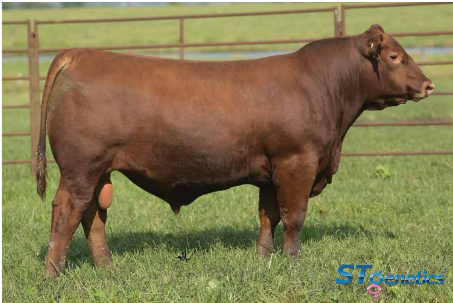
LOT 5 - LACY COLLUSION 115F