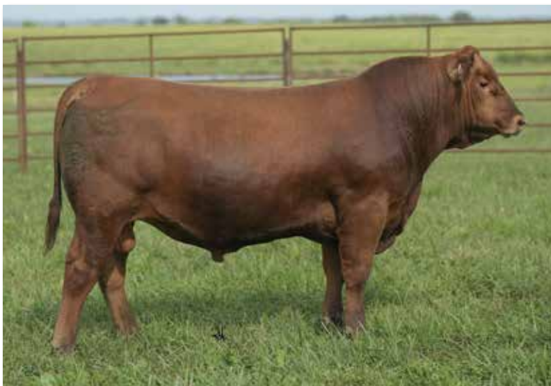
LOT 32 - LACY GROUND GAME 139F