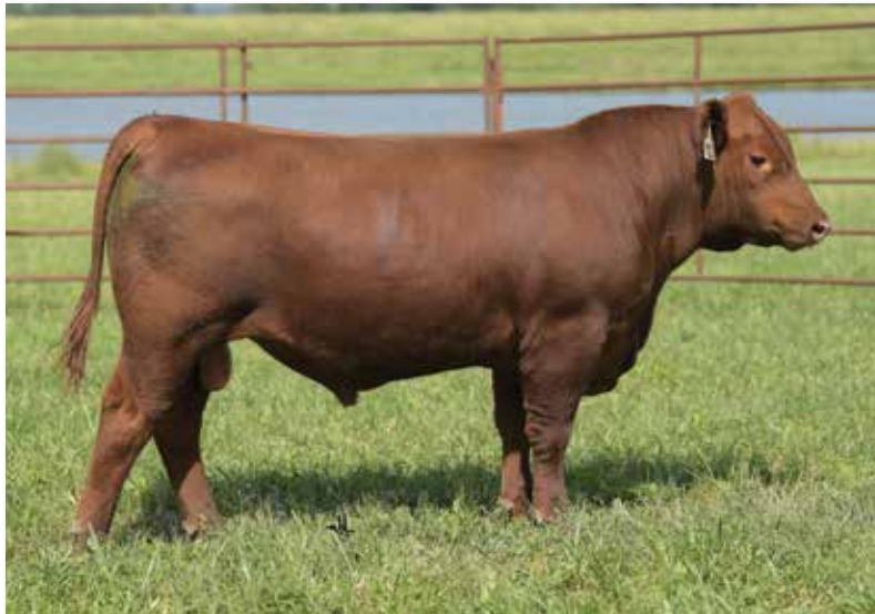
LOT 14 - LACY LEGACY 417 074F