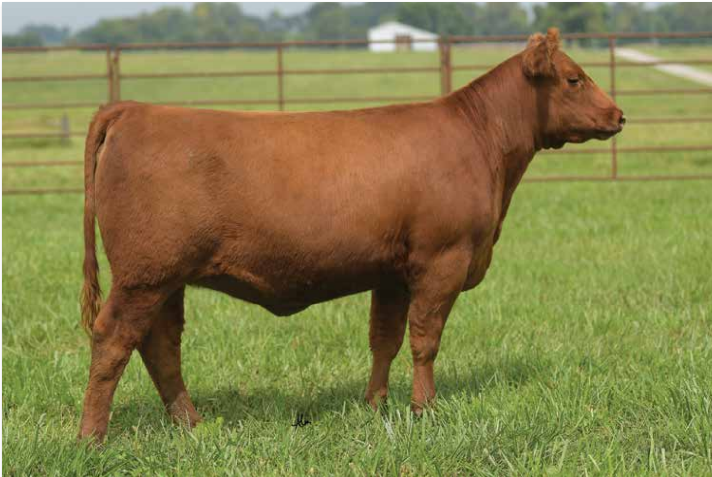
LOT 61 - LACY MARIE 442 081F

Lacy Marie 442 081F continues the legacy of the Marie 237 and Marie 8190 matrons that have greatly impacted this 4th Annual Production Sale offering. She is sired by the time tested, proven, and customer approved Lacy Legacy 6097 417 stud that needs no introduction to the business. The dam of this powerful female is sired by the influence of Oly 554T, and maternally traces to Mari 237 and Marie 8190. She ranks top 13% HerdBuilder, top 10% CED, top 8% CEM, top 18% Stay, top 22% YG, top 24% CW, and top 13% REA. A combination female that offers carcass merit, real-world functionality, and a balanced number profile to aid in her legitimacy as a contributing female that is capable of impacting any outfit.