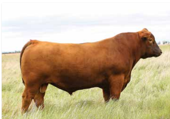
LACY PAYLOAD 1120 023C - SIRE OF LOT 39