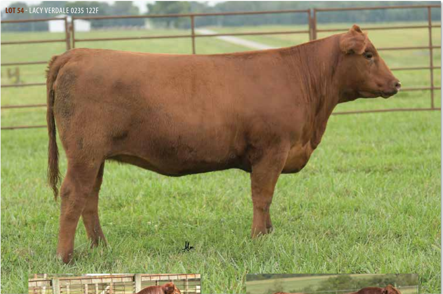
LOT 54 - LACY VERDALE 0235 122F