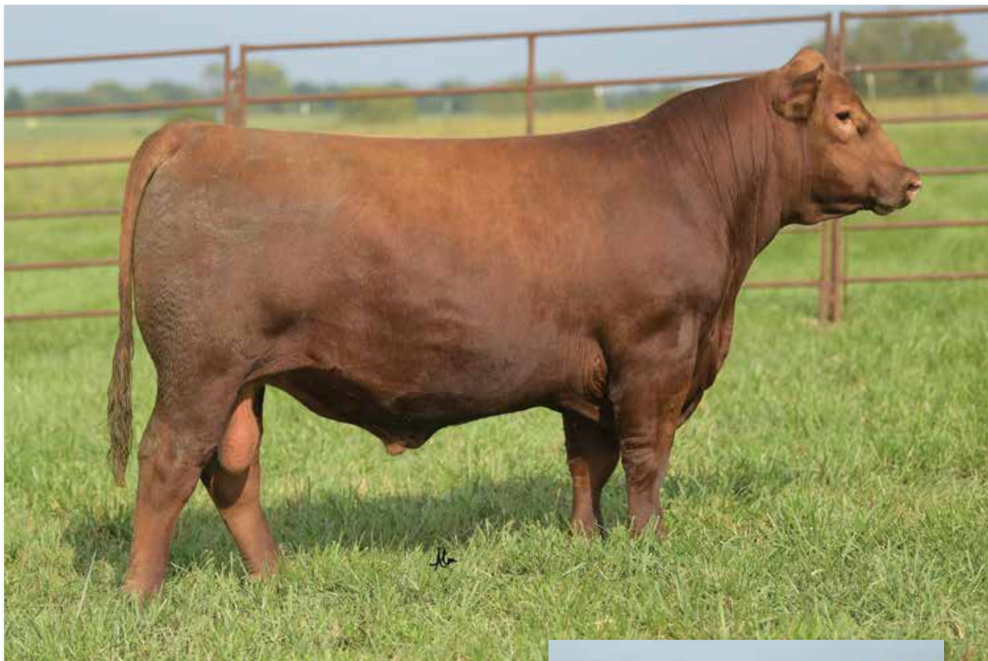
LOT 1 - LACY CENTERPOINT 448 025F