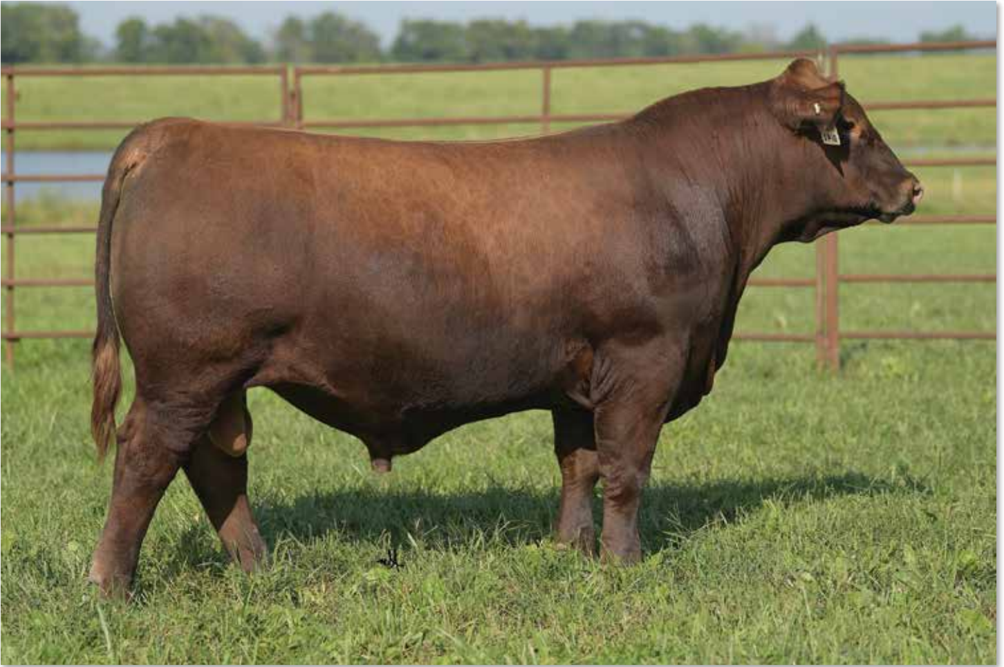
LOT 17 - LACY FREIGHT TRAIN 459 101F

Lacy Freight Train 359 101F has been a standout since day one! He is massive in his type and kind, so when it was time to name the leading herd sire prospects it just made sense! Freight Train is a full brother to the $16,000 sale topping Lacy Signature 459 075E to U-2 Ranch of Canada. He is a long sided, shapely bull that is big footed, stout boned, and offers exceptional performance to accompany his eye catching phenotype. Freight Train 101F is sired by Signature 459 and is backed by the 8105, making him a maternal brother to lot 1, 5, and 6. 8105 is a true matriarch female in the Lacy's Red Angus program and the proof is in the progeny! Freight Train boasts balanced figures, ranking among the elite 1% of the breed for HerdBuilder, top 10% Milk, top 19% YG, top 1% Stay, and top 21% REA. A carcass oriented stud that is stout, rugged, and generationally adapted to the fescue forage conditions of west central Missouri. A bull that will experience extensive use in our AI and ET program moving forward! Offering two-thirds semen interest and possession.