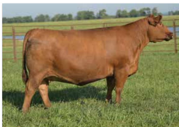
LACY LAKOTA 8105 - DAM OF LOTS 5 & 6

Lacy Collusion 115F is the lead off son of the great Fritz Justice 8013 and backed by the Lacy Lakota 8105 matron that is also the dam of the lot 1 strong aged lead off bull. Collusion 115F is without question one of the most balanced and complete herd sire prospects ever produced in Drexel, Missouri and we believe he offers tremendous promise. Not only is he rugged in his basic build, bold in his rib design, and he too offers superior structural integrity. Numerically he is a standout, ranking among the elite 1% of the breed for HerdBuilder, top 13% for GridMaster, top 11% WW, top 7% YW, top 5% ADG, top 10% Milk, top 1% Stay, top 14% REA, and top 16% CW. He is a multi-faceted herd sire prospect that we will use extensively in our AI and ET program at Lacy's Red Angus. Balanced and proven genetics at their finest can be found in Collusion 115F!