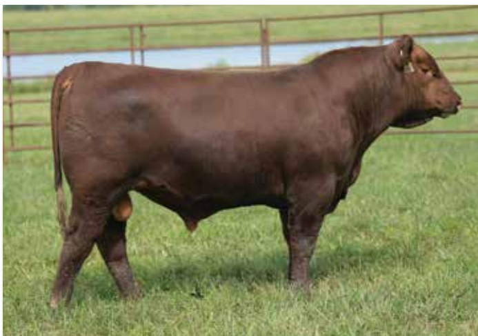
LOT 7 - LACY OBSTRUCTION 113F