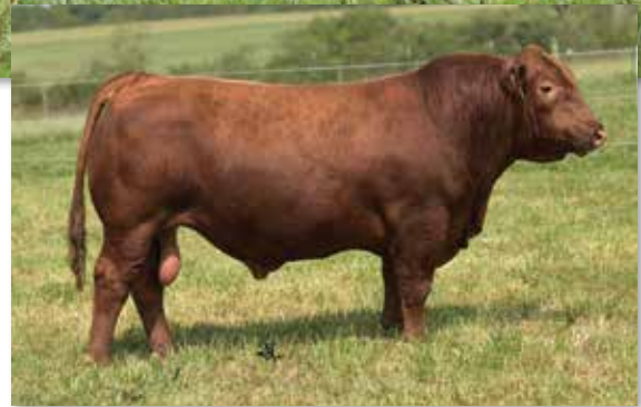
LACY FULL TANK 006D - SIRE OF LOT 55