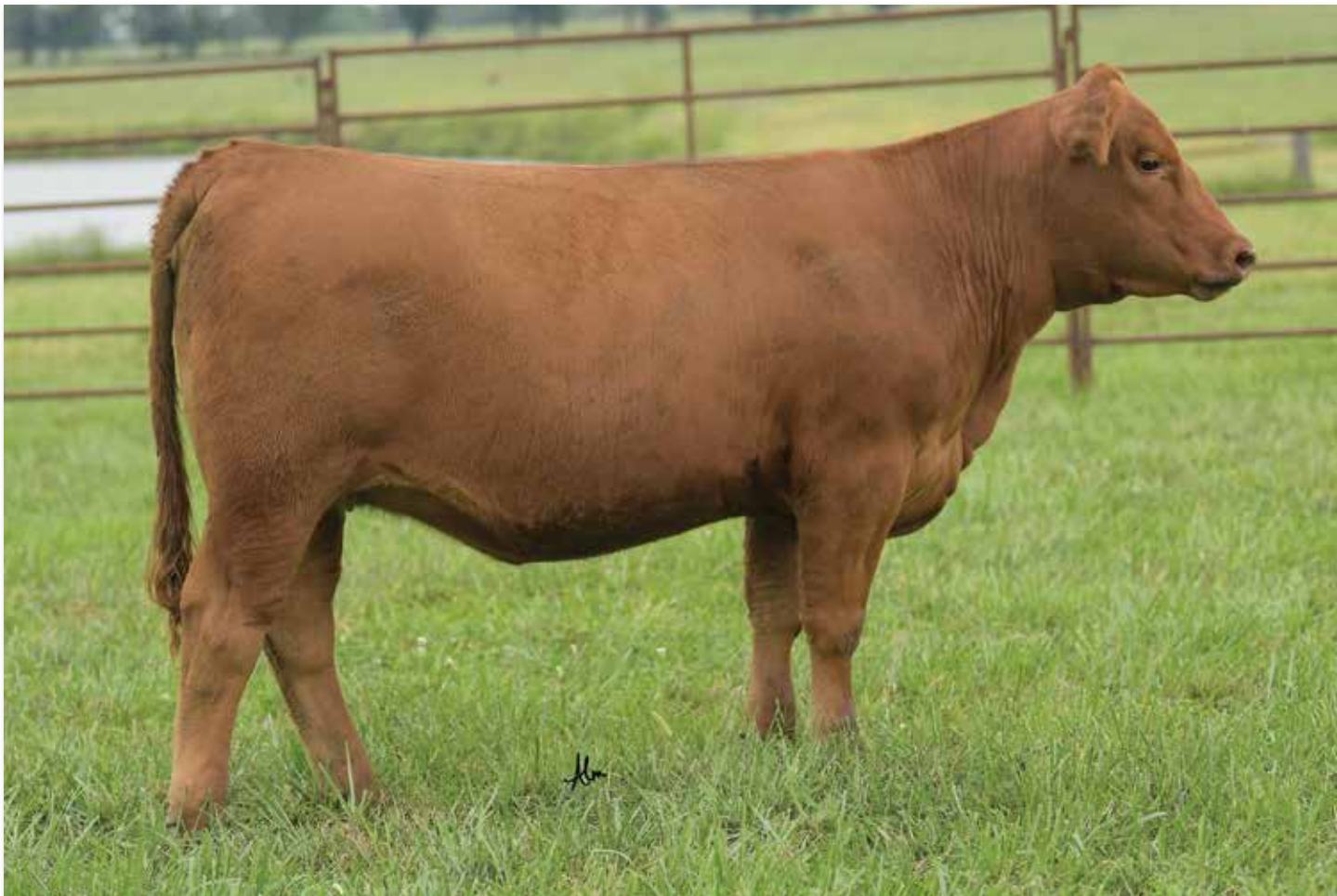
LOT 50 - LACY MARIE 063C 065F

065F is sired by Lacy Payload 1120 023C, a previous sale feature herd sire prospect that is supported by the Mattie 110 matron. This moderate framed, massive centered, three-dimensional female is from the Lacy Marie 8190 063C ET female that has emerged as one of the premier young females in the program. Her grandam is the power cow, Marie 8190 that is pictured. She ranks among the top 16% for HerdBuilder, top 7% WW, top 11% YW, top 25% ADG, top 7% Stay, top 12% CW, and top 7% REA. A combination type female that is backed by a true power cow that defines femininity and balance!