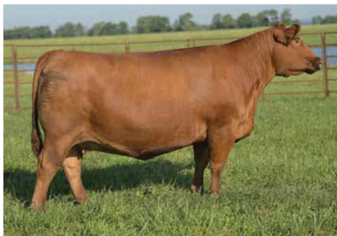
LACY LAKOTA 8105 - DAM OF LOT 66

Lacy Lakota 7099 109F is the result of a successful flush sired by Lacy Signature 459 and from the Lacy Ruby 7099 matron. The influence of 7099 can be identified as the maternal grandam of countless individuals throughout this very offering. She ranks among the top 20% for HerdBuilder, top 8% Milk, top 14% Stay, top 29% Marb, top 25% YG, and top 17% Fat.