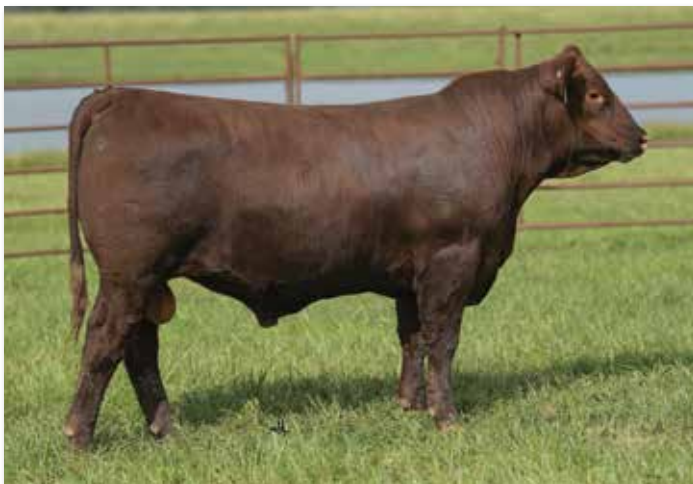
LOT 8 - LACY JUSTICE 086F