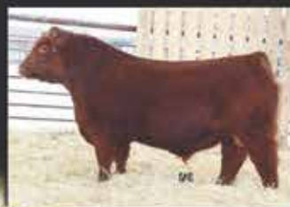
Bad Moon Rising, sale photo