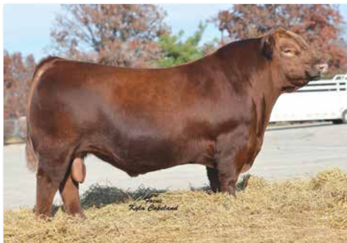
SILVEIRAS MISSION NEXUS 1378 - SIRE OF LOTS 59 & 60