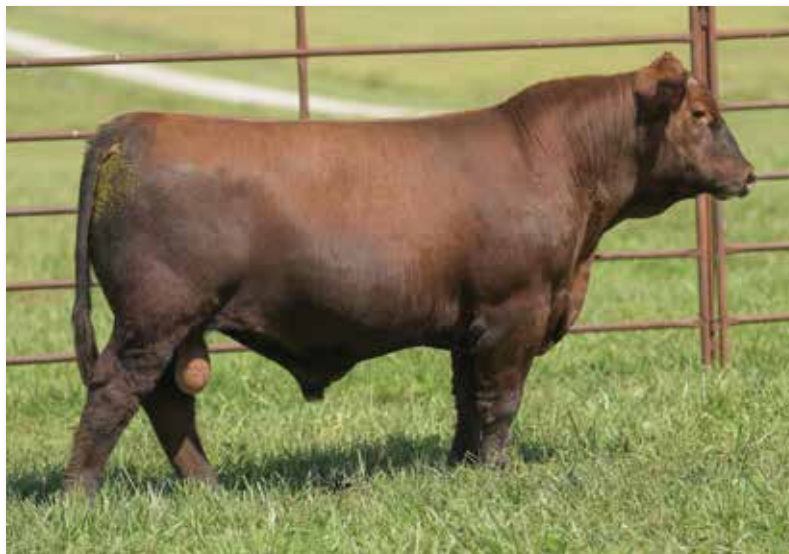
LOT 18 - LACY SIGNATURE 459 073F