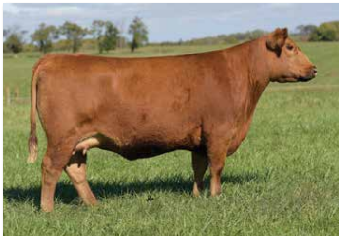
LACY LAKOTA 7097 482 - MATERNAL GRANDDAM OF LOT 70

Lacy Lakota 056D 131F is sired by the great breeding bull, BUF CRK The Right Kind U199, a sire that has left behind a stellar set of daughters across the nation. On the maternal side she is backed by the Lakota tribe and influenced by Peacemaker 1216. She charts top 9% GridMaster, top 7% WW, top 9% YW, top 16% ADG, top 15% Milk, top 20% ME, top 8% HPG, top 19% Marb, and top 22% YG.