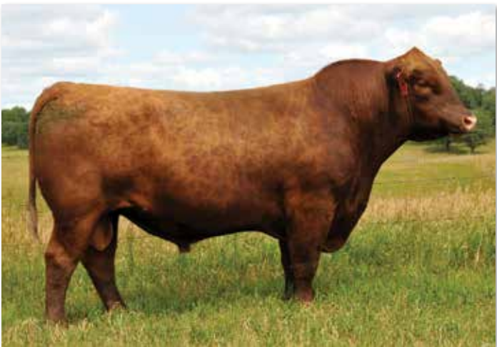
5L INDEPENDENCE 560-298Y - SIRE OF LOTS 47 - 49