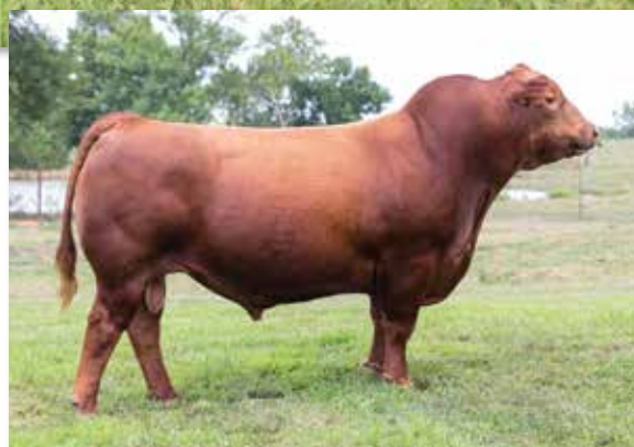
LACY LEGACY 6097 417 - SIRE OF LOT 4