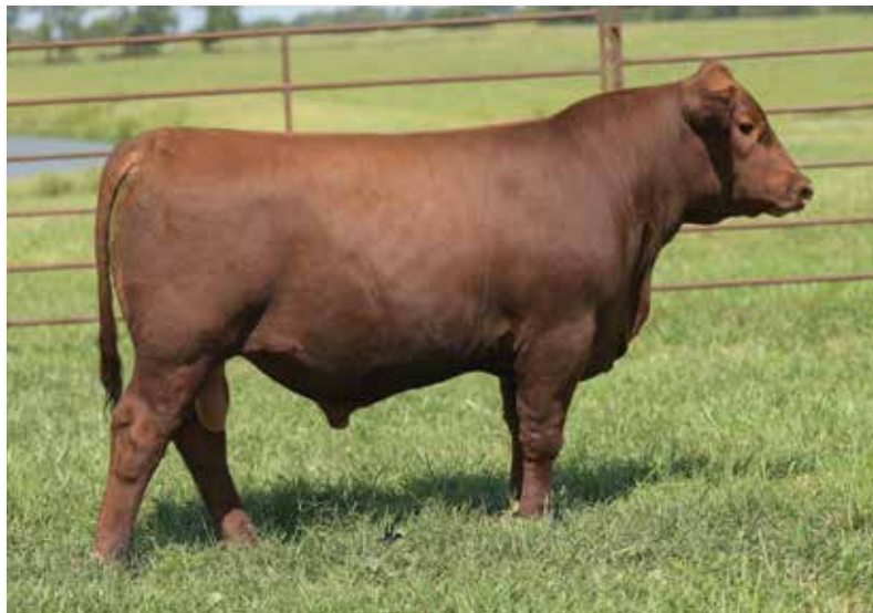
LOT 37 - LACY GOLD BAR 088F