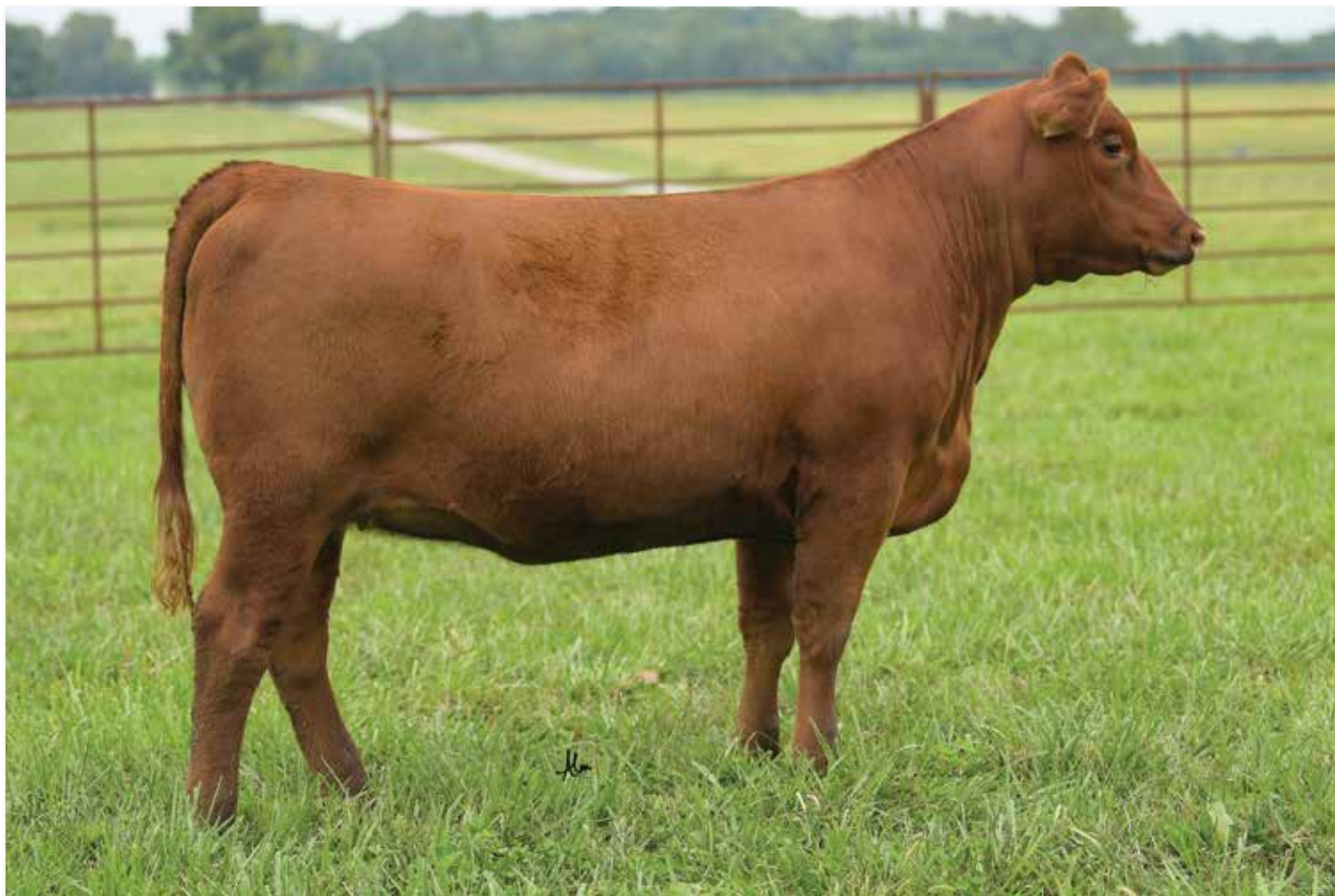
LOT 48 - LACY LANA 7025 099F

Lana 7025 099F and Lana 7025 107F are two other members of the powerful Independence x Lana 7025 flush that yielded tremendous phenotype and performance in a perfectly blended package. Generations of maternal power cows line the pedigree of this mating and we believe that these females will make role model type females in the pasture. The toughest decision is which of the three females will be the best generator? We will let you sort them on October 27 in Drexel, Missouri!