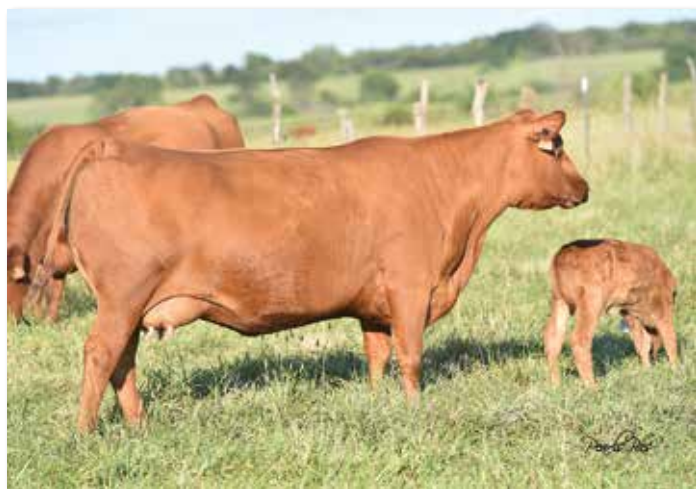
LACY LAKOTA 9049 - DAM OF LOT 32