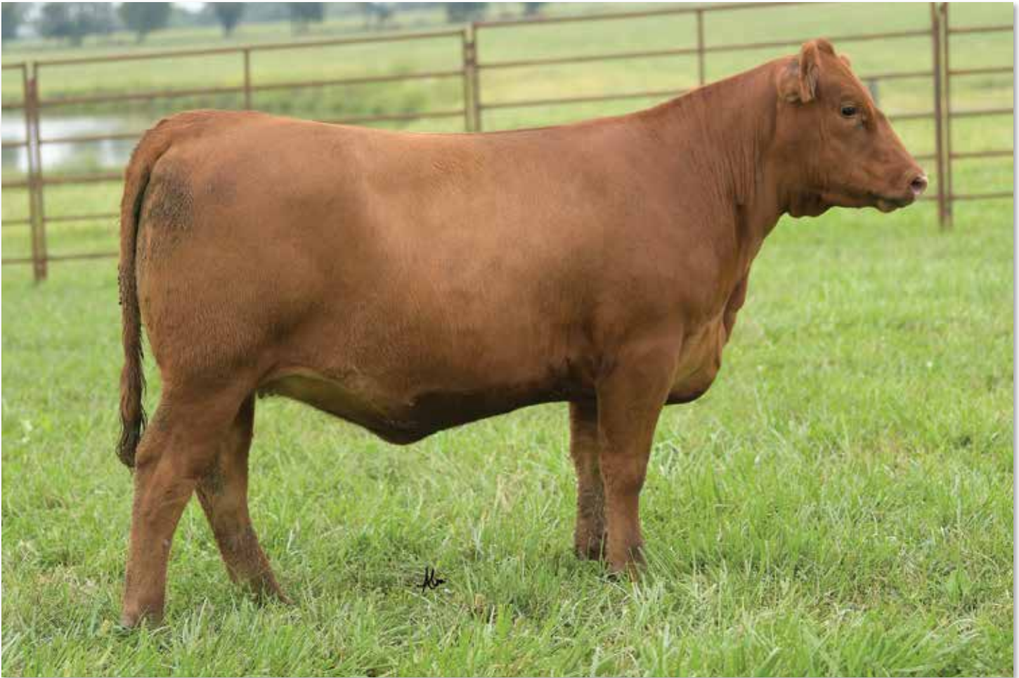
LOT 60 - LACY MARIE 074C 079F