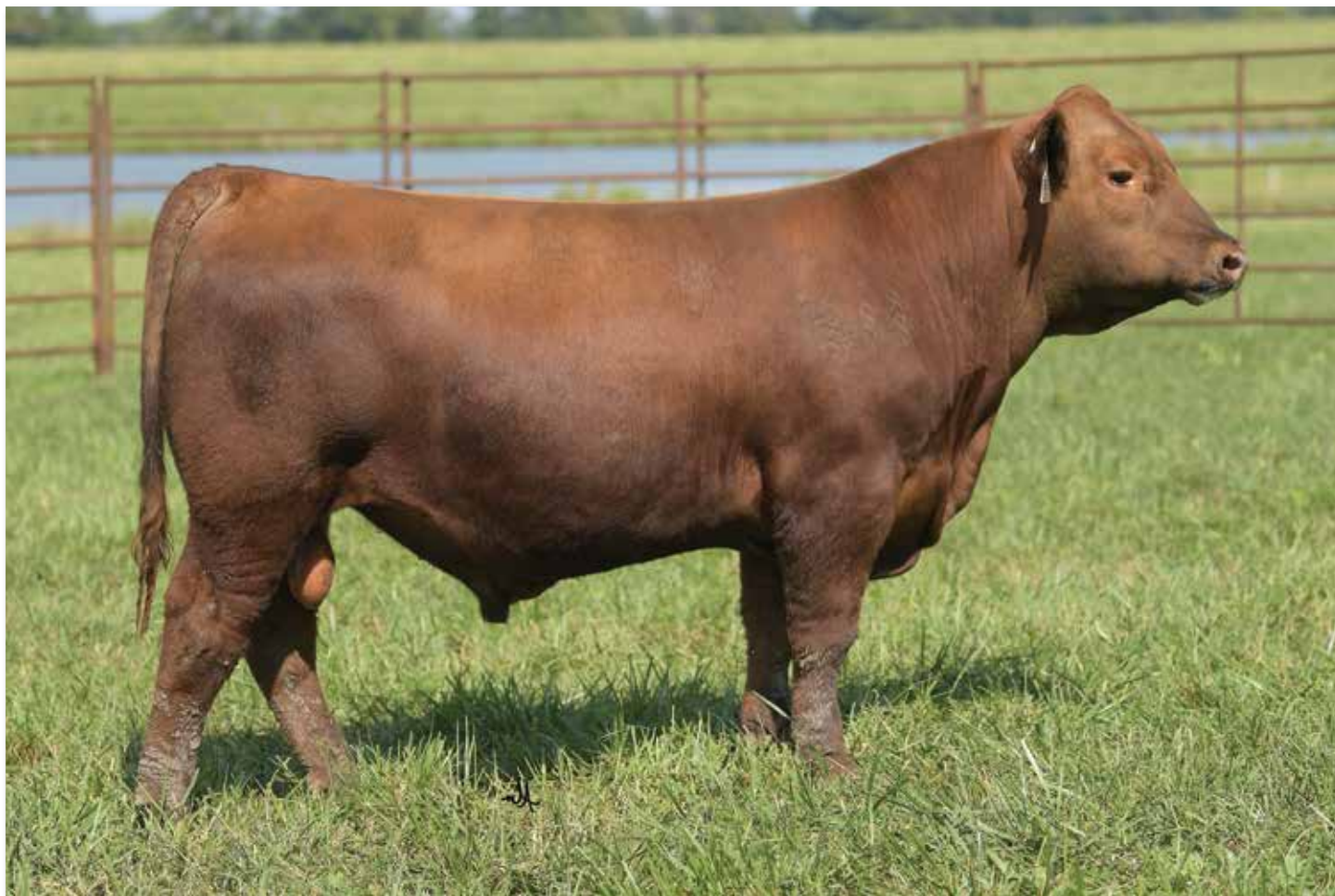
LOT 11 - LACY LEGACY 417 083F