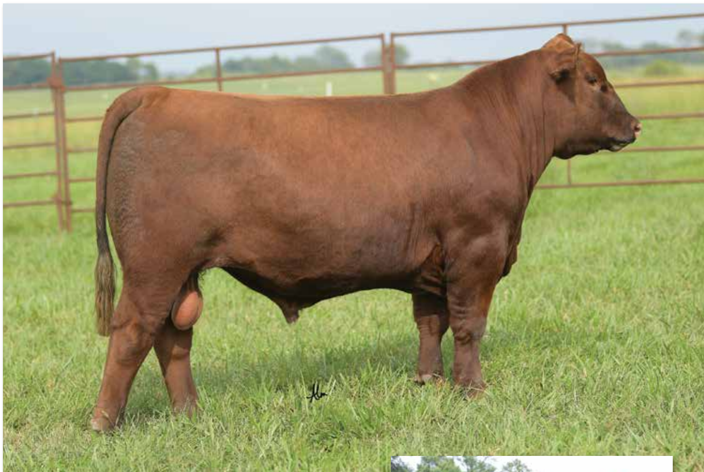
LOT 4 - LACY DETERMINATION 417 005F