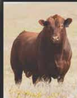
Red Howe Hesston 212C, sire of Bad Moon Rising