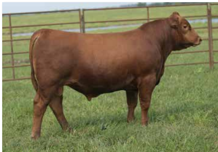
LOT 29 - LACY ENDORSEMENT 075F

Lacy Endorsement 075F is by Lacy Endorsement 092C, a sale feature in the 2016 Production Sale that was selected by Prairie Creek Ranch of Richards, Missouri. 075F is a smooth joined, long bodied, well-balanced individual that we admire for his heifer safe capabilities. With a 70-pound birth weight, his numbers also read to be a strong calving ease option. He ranks top 26% HerdBuilder, top 25% CED, top 16% CEM, and top 28% Stay. Another sure fire heifer safe option from a generational cow family that doesn't miss!