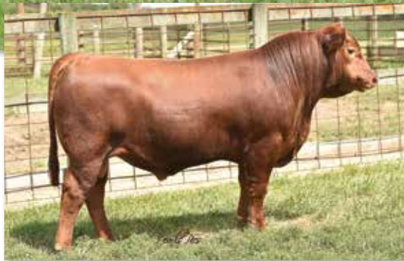
LACY CORNERSTONE 069C - SIRE OF LOT 54