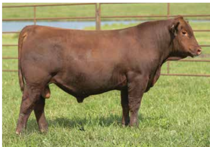
LOT 31 - LACY FULL TANK 059F

Lacy Full Tank 059F is sired by Lacy Full Tank 006D that is a walking herd sire at Lacy's Red Angus. He is loaded with power, substance, and shape from end to end. The dam of 059F is the Lacy Sirena 8063 matron that offers textbook udder quality, body mass, and overall dimension. 059F ranks among the top 27% of the breed for GridMaster, top 26% for WW, top 27% YW, top 29% ADG, top 10% HPG, top 15% YG, top 4% CW, and top 6% REA. There is no doubt that this Full Tank son offers breed leading strength and is backed by one of the premier females in the program!