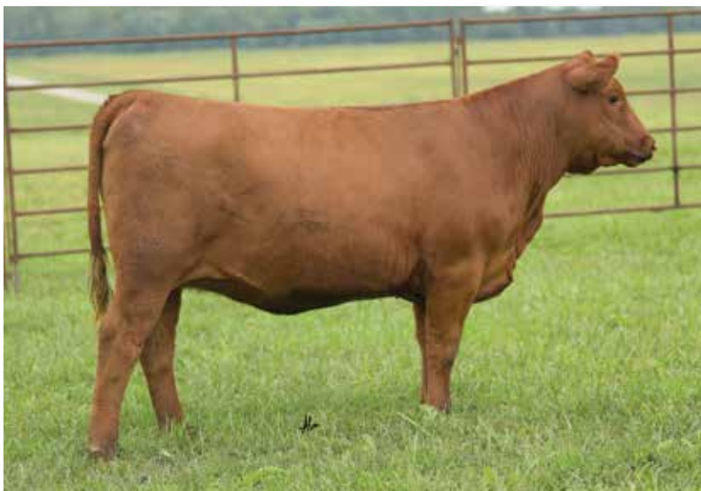
LOT 56 - LACY ANNIE 0233 070F