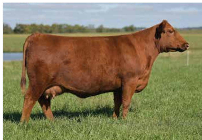
LACY MARIE 8190 - DAM OF LOT 37

Lacy Gold Bar 088F is straight from the ET program at Lacy's Red Angus, sired by the tried and true CCF Gold Bar 0251, and backed by the staple donor Lacy Marie 8190. He is a great structured, smooth made, well-balanced stud that offers a sensible birth weight of 75 pounds at birth, while charting among the top 6% of the breed for HerdBuilder, top 4% Milk, top 16% CEM, top 1% Stay, and top 22% YG. He is a stout bodied, powerful individual that we believe offers heifer safe capabilities on well-managed heifers.