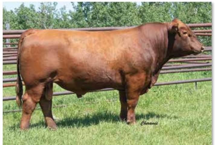
FULL BROTHER TO LOT 17 AND 17A EMBRYOS

Measurements - IMF: 2.68 | REA: 11.74 | BF: 0.15