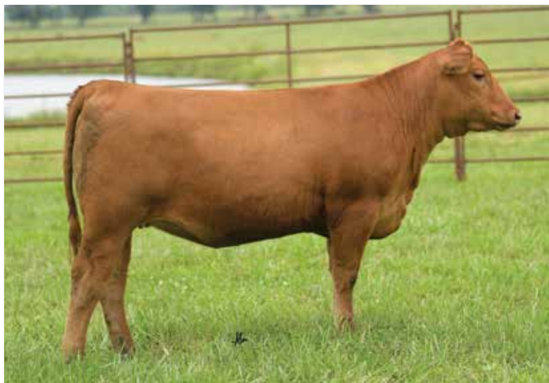
LOT 62 - LACY ROBIN 8080 060F