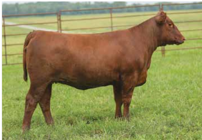
LOT 71 - LACY LAKOTA 084C 105F

Lacy Mattie 033D 129F descends from the Mattie 1122 matron of our program. Her sire, a past sale feature, Lacy Innovator 018C, was purchased by the McCarty Cattle Company program of Novinger, Missouri. This female is smooth made, angular, and offers a low input look. She charts top 28% GridMaster, top 22% BW, top 20% Milk, top 13% CEM, top 23% Marb, and top 22% CW.