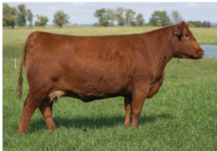
LACY LAKOTA 0251 326 - DAM OF LOT 51

Lacy Cornerstone 069C, a sale feature in a previous production sale is the sire of this high volume, big middled female that is from the influential 8190 donor dam. Her dam, 062C ET is a flush mate sister to the dam of lot 50, 063C ET. This female charts balanced numbers that are highlighted by her ranking among the top 27% Stay, top 27% REA, and top 28% YG.