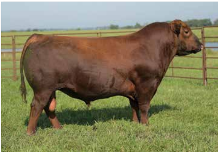
LACY FOUNDATION 448 - SIRE OF LOTS 22 - 26