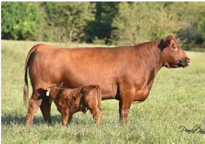
LACY SIRENA 8063 - DAM OF LOT 7