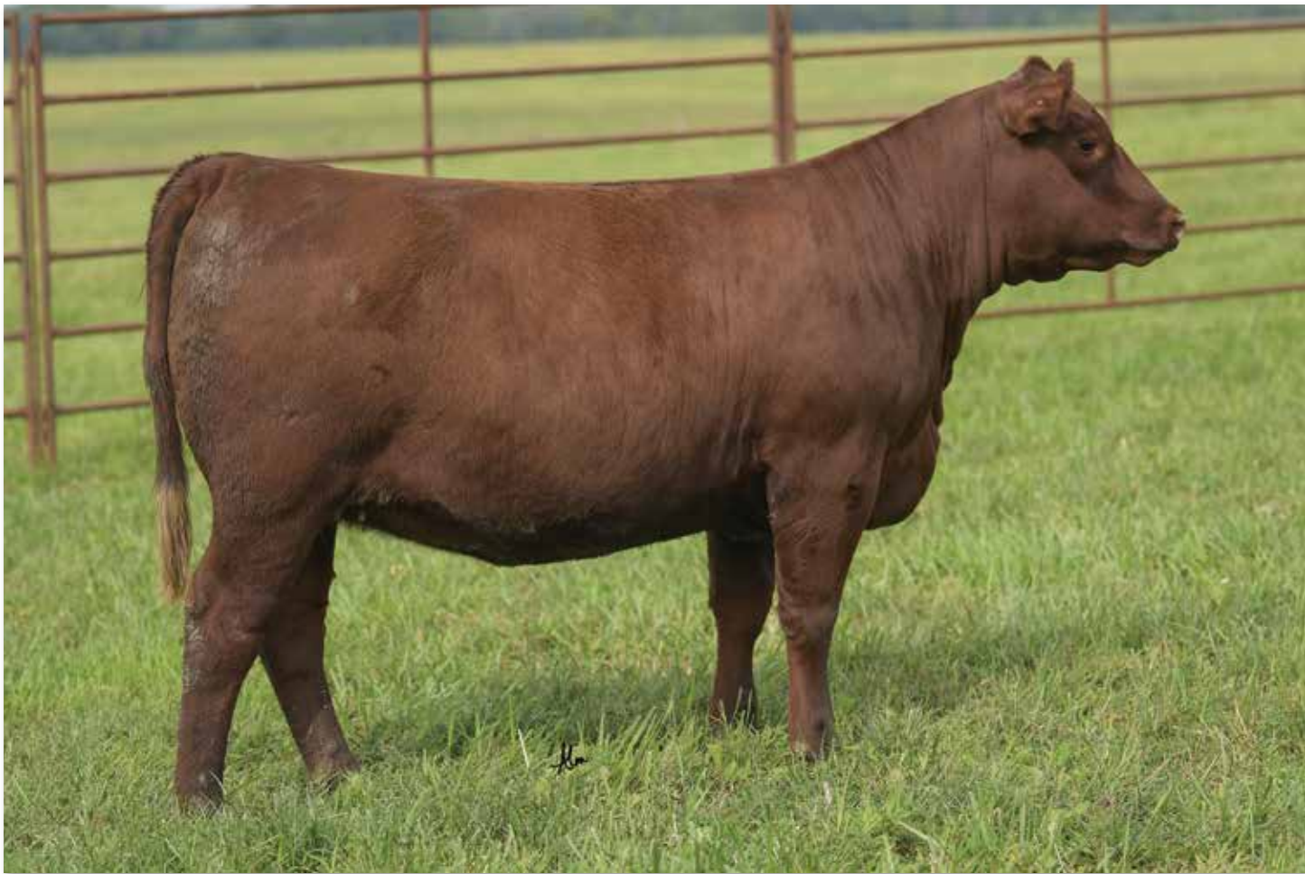
LOT 47 - LACY LANA 7025 097F