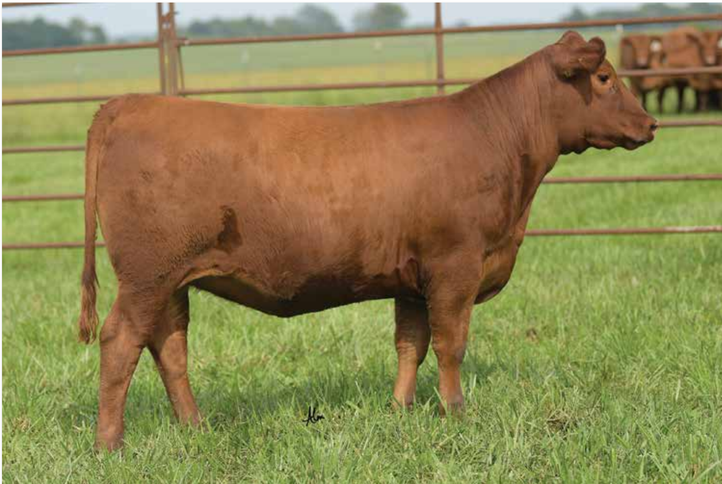
LOT 59 - LACY LAKOTA 061D 103F

Lacy Lakota 061D 103F is a stunning daughter of the popular and proven Silveiras Mission Nexus 1378 sire that has taken the breed by storm in terms of siring cattle with function, quality, and balance in all aspects of economic importance. The dam of this sharp featured young lady is by LSF Saga 1040Y and from the influential CCF Gold Bar 0251 on the maternal side of her lineage. 103F offers a look of a brood cow in the making phenotypically. She further solidifies these credentials with her top 19% BW, top 17% YW, top 13% ADG, top 26% YG, top 20% CW, and top 25% REA rankings.